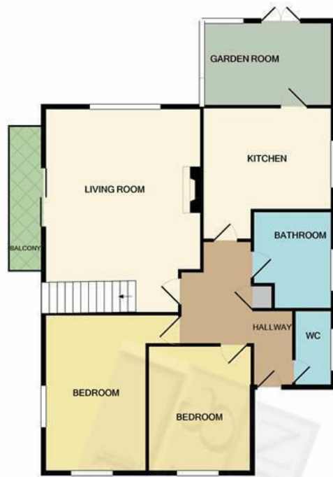
1ST FLOOR APPROX. FLOOR AREA 993 SQ. FT. (92.3 SQ.M.)