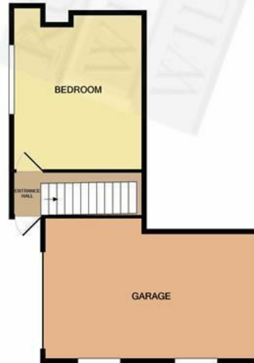
GROUND FLOOR APPROX. FLOOR AREA 491 SQ. FT. (45.7 SQ.M.)

TOTAL APPROX. FLOOR AREA 1485 SQ. FT. (137.9 SQ.M.)