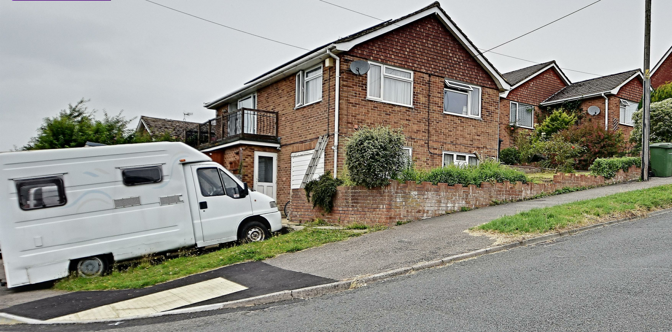
9 Long Avenue, Bexhill-On-Sea, East Sussex TN40 2SJ £365,000